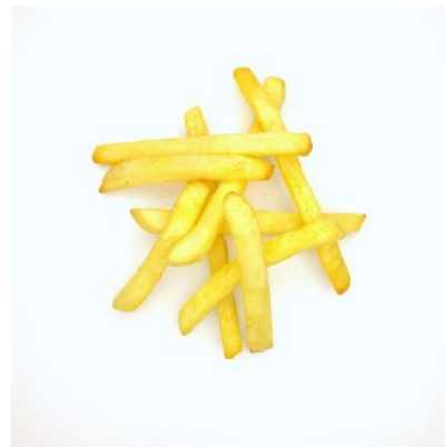
Oven baked product